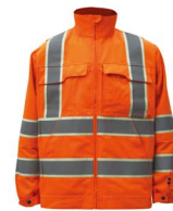
Glow Gear Soft Shell Jacket