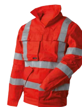
Flame Gear Jacket

For further information please contact us on :